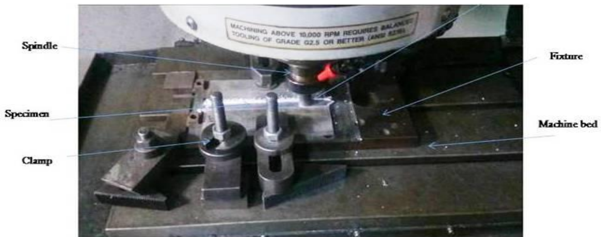
Figure 2:- Tensile testing specimens.

A special designed fixture was firmly fixed on the machine bed with help of clamps and then plates were held in the fixture properly for Friction Stir Processing. The set up is shown in Figure no. 2