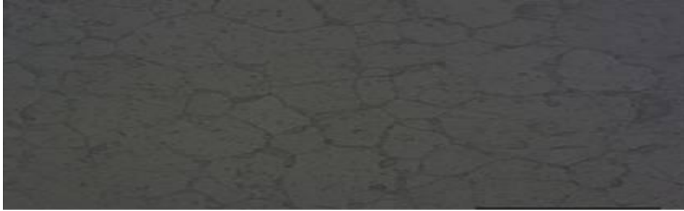
Figure 4:- Microstructure of Base material AA 6063.