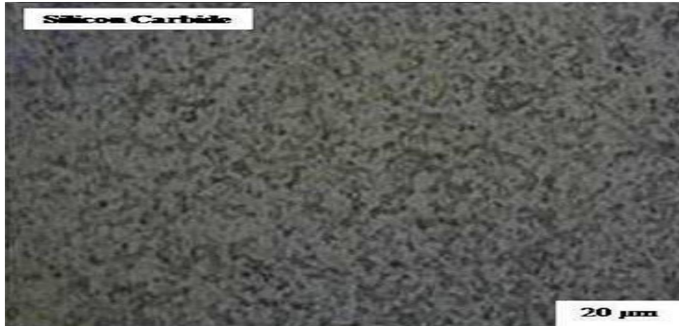
Figure 5:- Microstructure of Stir Zone of welded joint

Figure 5, shows the dispersion of Silicon carbide particles in the stir zone at tool rotational speeds of 1400 rpm and welding speed of 65 mm/min. It is revealed that homogeneous dispersion of SiC particles is achieved at selected parameters. The dispersion of SiC particles is considered for more effective formation of fine grain structure due to the restraint of grain boundary and the enhancement of the induced strain. Mainly, the micro hardness value depends upon the presence and uniform distribution of these particles.[11]