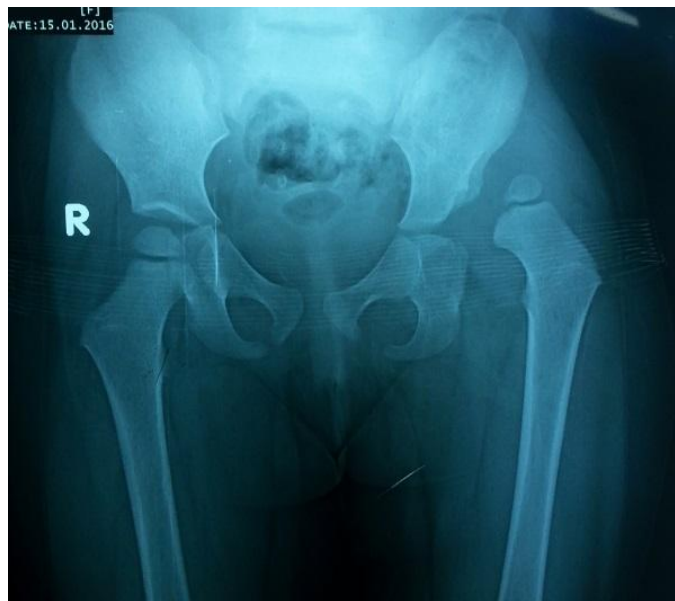
Figure 1:- Female patient 2.6ys old with pre-operative acetabular index is 50^\circ

Computed tomographic scan (CT) was performed for all patients postoperatively to check the adequacy of the reduction within 1 week after the surgery.