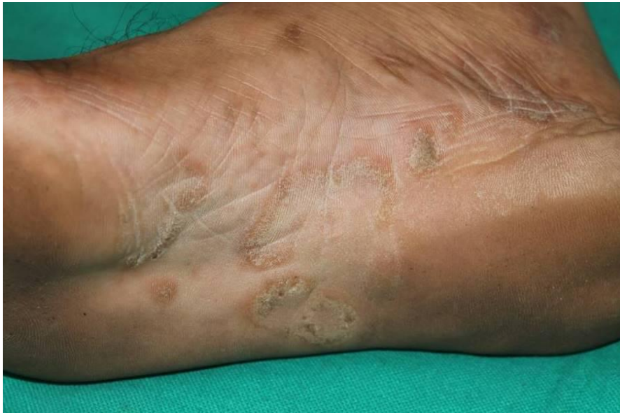
Fig 1:- Tinea pedis over right sole showing hyper pigmented; scaly, sharply margined 3-4 lesions with slightly raised borders.

The Gram stain showed the absence of bacteria and no acid fast bacilli by Ziehl Neelsen stain. The microscopic examination of skin scraping after treatment with 10% KOH revealed the presence of septate hyaline hyphae. The material was cultured in Sabouraud dextrose agar (SDA) slant tubes with and without cycloheximide. SDA without cycloheximide grew smooth, white colonies initially and matures to velvety, jet black center with characteristic white apron or brim and no reverse pigment after about 7 days (Fig. 2). Lactophenol cotton blue (LCB) mount showed hyphae with black colour, erect conidiophores terminated with radiating phialides covering entire vesicles (Fig. 3). The fungus was identified as Aspergillus niger with the help of cultural characteristics and the typical microscopic features of hyphae with black colour, erect conidiophores terminated with radiating phialides covering entire vesicles on LCB mounts. The same fungus was isolated again from repeat sample of skin scrapings. The patient was put on oral fluconazole 150 mg initially with topical 1% terbinafine cream twice daily and tablet cetirizine 10 mg one tablet at night for 10 days. He was switched over to oral itraconazole and continued with terbinafine cream and cetirizine. He was assessed for therapeutic success after 4 weeks and had shown significant improvement. Itraconazole and topical terbinafine was discontinued after 6 weeks and the lesions showed complete resolution in the next follow up.