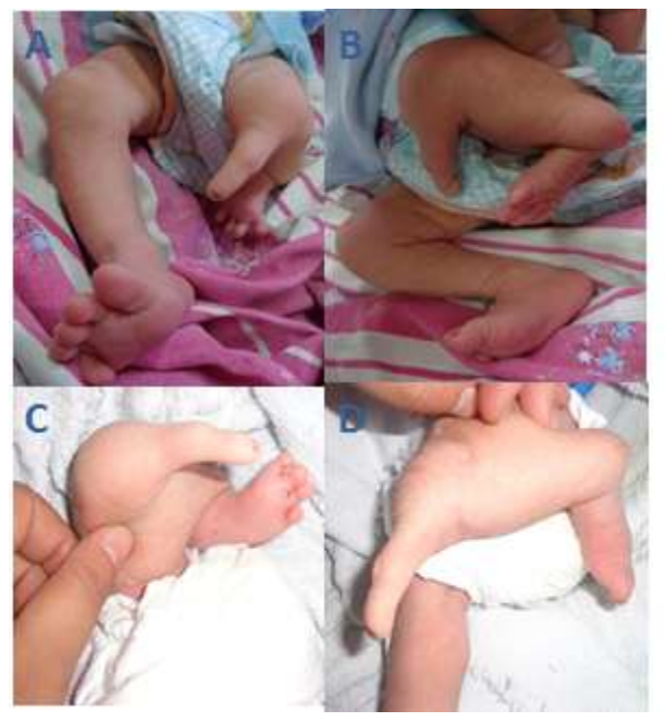
Figure.1 clinical photos of case 1 show complete diastasis of tibia and fibula