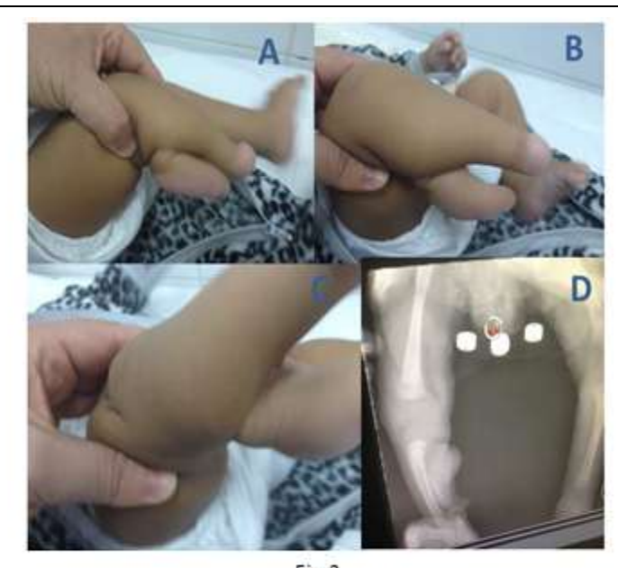
Fig.3 Clinical and radiographic photos of case 2 show partial diastasis of tibia and fibula