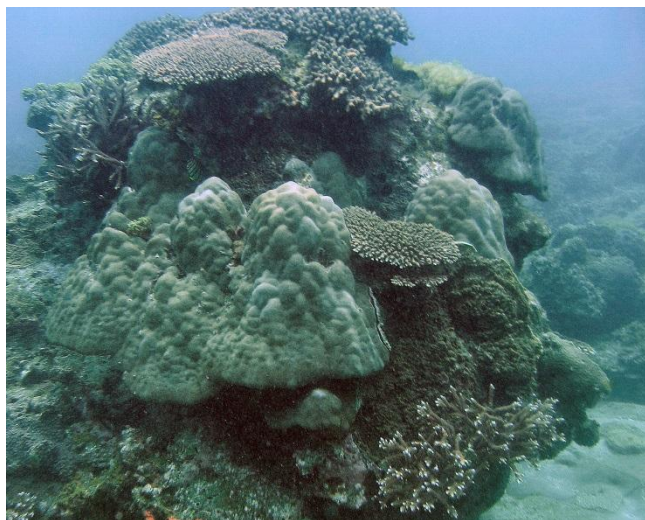
Figure 3. The appearance of bioherms, depth 6 m