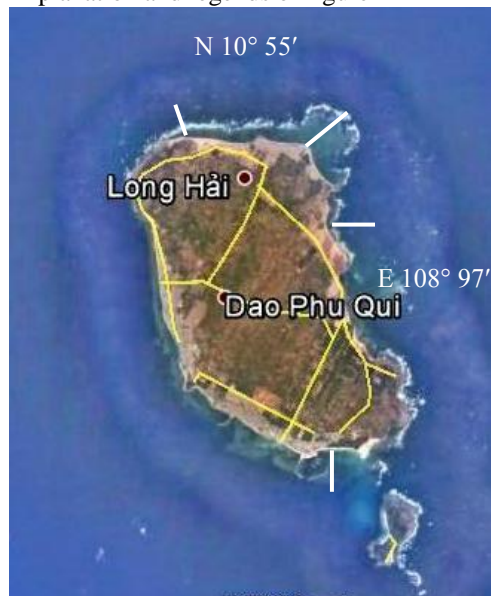
Figure: 1. Island NgũPhung and location of transects(white lines)