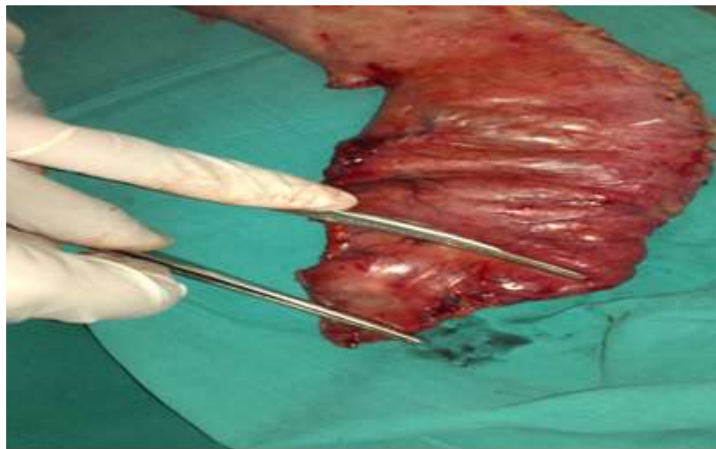
Figure II:- GIST at resected stomach