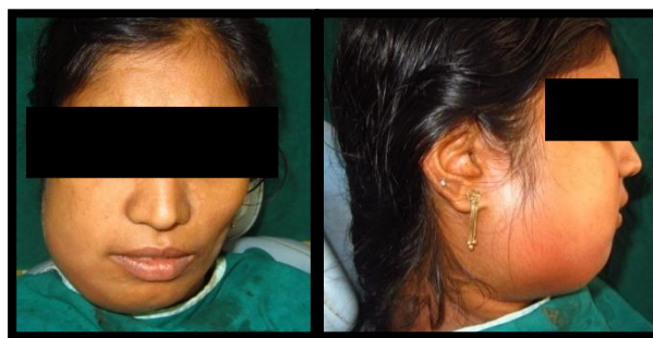
Figure 1:- Patient with Right Submandibular Space infection.