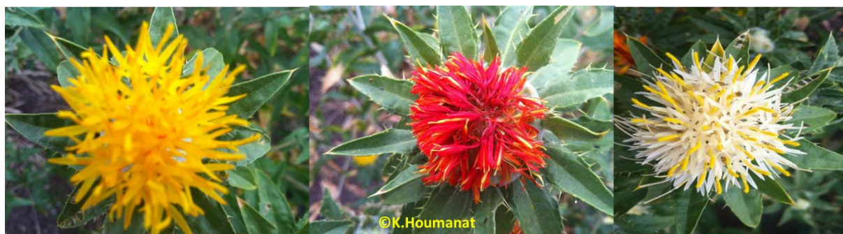
Figure 2:- Diversity in colors of safflower petals.

The accessions showed a variation in the color of their petals (COP): red, white, yellow, orange and intermediate color (Fig.2). Some studies have highlighted the close correlation between color of safflower petals and their biochemical composition, mainly the total polyphenol content (carthamin) (Hiramatsu et al., 2008). This component, which is characterized by its high antioxidant properties, can be further explored and exploited for industrial and pharmaceutical purposes. Also, the accessions studied showed a large variation in the degree of spinelessness (SL) at leaves and bracts, varying from strongly spiny to completely spineless. On average, the accessions were spiny (2.96); therefore, a large number of genotypes had fewer spines than the check variety (Rancho), which is too spiny (4). Comparable findings had been reported by Nabloussi et al. (2008). Narkhede and Deokar, (1990) reported that the spiny type is generally dominant over the spineless type in safflower genotypes. It was reported that cultivation of safflower was not widely practiced because of the presence of spines, which is a major constraint for some operations, such as harvesting and threshing (Nabloussi and Boujghagh, 2006; Sujatha, 2008). Thus, one of the main objectives of safflower breeding programs is to develop spineless varieties with high yield and high oil content (Nabloussi and Boujghagh, 2006; Golkaret al., 2010).