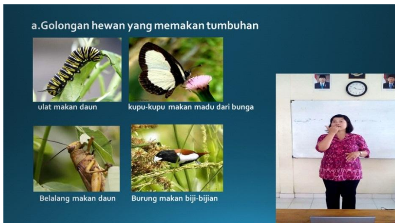
Figure 3:- Example of Science Content: Animal Classification Based on Types of Food.