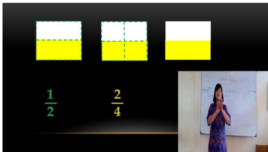
Figure 2:- Example of Mathematical Content: Equivalen Fractions.

The audiovisual media for training, taking subjects of mathematics and science for elementary school of special school (Sekolah Dasar Luar Biasa Bagian B/SDLB.B). The subject for the mathematics is equivalent fractions (Figure 2) and for science using sample materials: Animal classification based on types of food (Figure 3). For each audiovisual material with video of instructor using the Indonesian Sign Language System (Sistem Isyarat Bahasa Indonesia/SIBI).