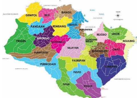
Figure 1. The distribution of 24 districts in Pasuruan

The drinking water stations in Pasuruan Regency's District were selected as the sampling locations. There were 24 districts that included in figure 1 and table 1. The water samples were collected from representative area of Pasuruan's districts. The districts were included Bangil, Beji, Gempol, Gondangwetan, Grati, Kejayan, Kraton, Lekok, Lumbang, Nguling, Pandaan, Pasrepan, Pohjentrek, Prigen, Purwodadi, Purwosari, Puspo, Rejoso, Rembang, Sukorejo, Tosari, Tukur, Winongan, and Wonorejo. Each district had different total of water drinking stations (Table 1). However, only water drinking stations that already commercially distributed in market were chosen for its quality analysis in this study.