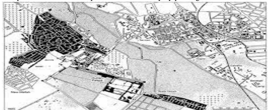
Figure 1:-Extract of a PA scanned

This requires the use of modern means of land management such as GIS, geographic databases that facilitate traditional work. The use of GIS should constitute a considerable gain in time. Urban management is a complex process that requires a substantial base of information and coordination between different actors (including urban agency, prefecture, and municipality) of urban space. In developing countries, this management is made more difficult by the lack of financial resources and technical skills. For this reason, the traditional tools of the development do not have the desired efficiency. Instruments such as GIS greatly increase the phenomena of urban management. The success of the GIS project will be measured by the willingness of city stakeholders to work together for a shared regional project on common themes. In addition, the exchange and sharing data will better qualify them, avoid duplication and ultimately increase efficiency by pooling efforts.