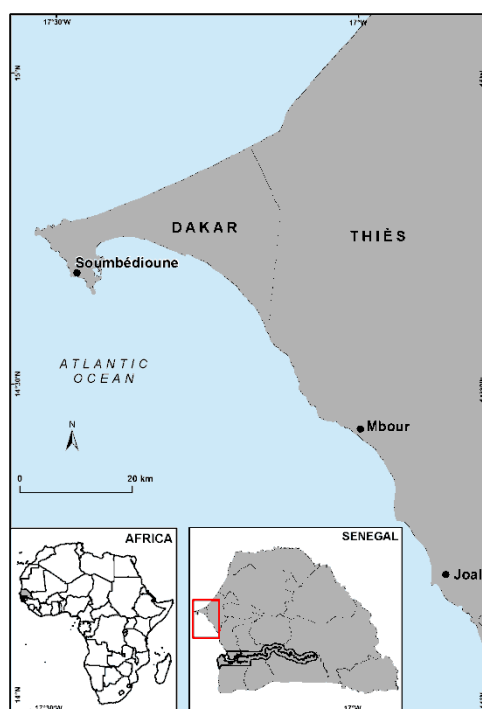
Fig. 1 Map of the study area