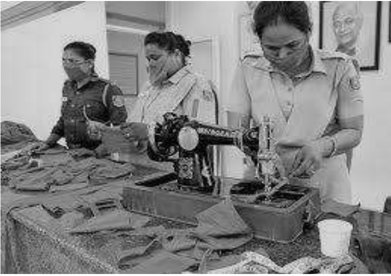
Photo 2:- Three women cops engaged in sewing the mask for poor people.