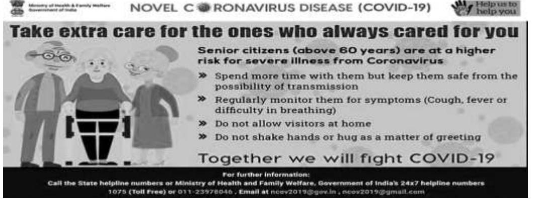
Photo 1:- A Health Ministry poster regarding precautions to be taken by the elderly.