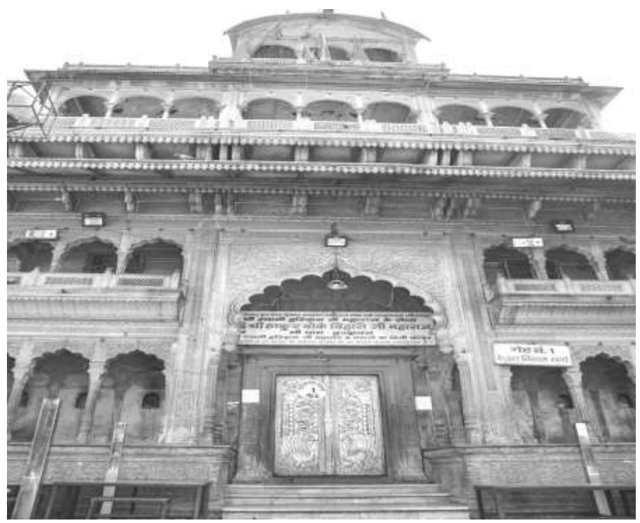
Photo 3:- The Banke Bihari Temple in Mathura closed due to Corona Virus.