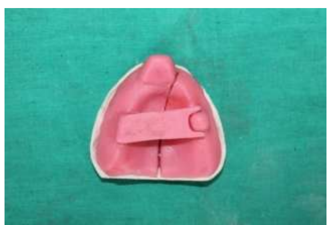
Fig 3:- Sectioned self-curing acrylic resin tray fabricated on the primary cast.

The second tray which is a complex design included an acrylic bar attached to one part of the tray & an acrylic stud on the other half for attachment to properly align the sections of the trays extra-orally (Fig.3 and 4).