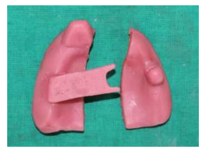
Fig 4:- One half of the tray containing acrylic bar & the other half of the tray containing acrylic stud.