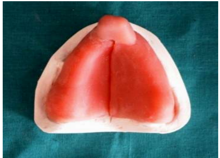
Fig 1:- Sectioned self-curing acrylic resin tray fabricated on the primary cast.

One of the tray designs included pin & sleeve in which one part of the tray was fabricated with pin as a handle & the other half of the tray contained the sleeve within the acrylic handle to fit the pin accurately for assembling the parts together as a single unit (Fig.1 and 2).