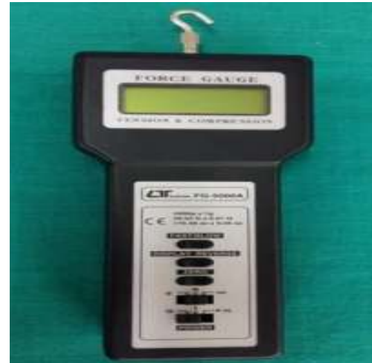
Fig 5:- Digital force gauge (Lutron FG – 5000A).

The retention of each denture was checked using a digital force gauge (Fig.5). The force values (in Newtons) displayed on the digital gauge at the moment of denture dislodgement were determined for each denture. The maximum force displayed on screen before dislodgement of the dentures in each group were obtained and tabulated for statistical analysis.