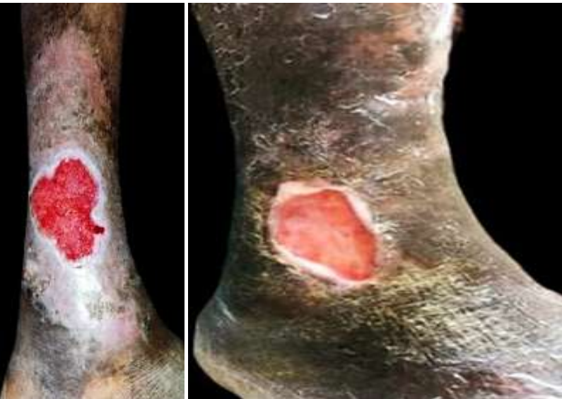
Fig no. 1:- Venous Ulcer.