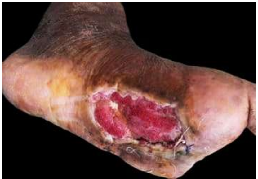
Fig.3: - Neuropathic Ulcer.