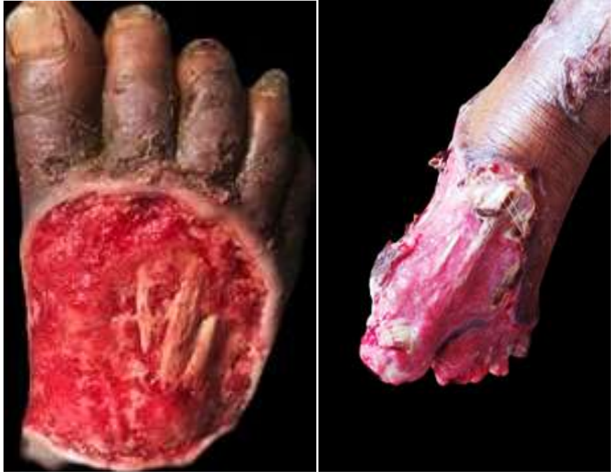
Fig.2: - Arterial Ulcer.