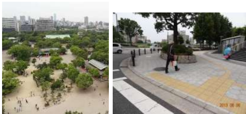
Fig. 12:- The neighborhood park is intended to provide an outdoor living room for the neighborhood.

For example, it is hot arid weather all-year around in City of Makkah, and the trees there are not so sufficient nor planted in proper location. In the researcher opinion, more plants can be planted in residential landscaping areas. There could appropriately increase the amount of green space, which could create a pleasant green environment and effectively improve micro-climate as well. The residential landscape design also has diverse requirements, for this feature, the following elements should be gained more attention: Local Climate, topography, Resource distribution, and surrounding of environmental characteristics (Fig.12 & 13).