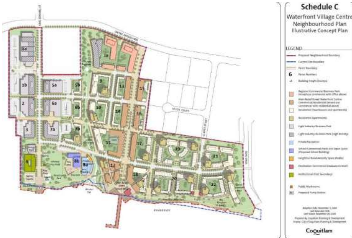
Fig. 6:- provision for open space in the form of gardens, parks, urban plazas, patios, balconies or terraces, depending on the characteristics of the development proposed and the surrounding context