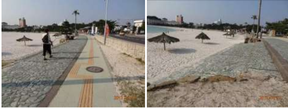
Fig. 20:- Respect for landform, creation of a distinctive sense of place, the overall permeability and legibility of the layout