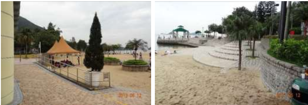
Fig. 19:- The development respects the surrounding context and is appropriate to the character and topography of the site in terms of layout, scale, proportions, massing and appearance of buildings, structures and landscaped and hard surfaced areas;