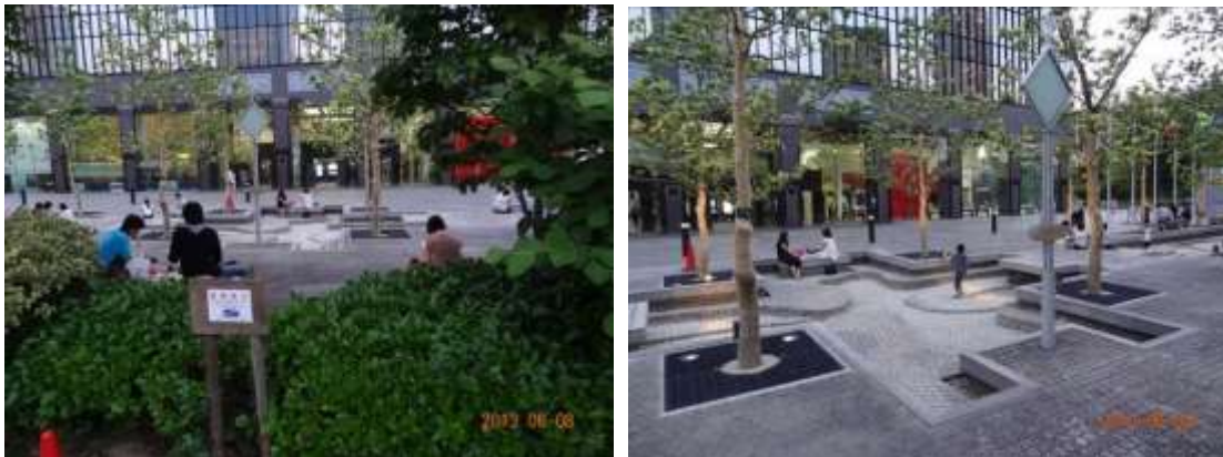
Fig. 9:- The necessary activity includes activities which are involuntary such as work, studying, shopping, waiting, etc. In other words, people are more or less taking part in the activities being as part of daily life

The necessary activity includes activities which are involuntary such as work, studying, shopping, waiting, etc. In other words, people are more or less taking part in the activities being as part of daily life. As most of those activities are related to walk, the road becomes an essential element regarding to the necessary activities in space. Because these activities are the ones which would be carried out by people, this kind of landscape space mainly provides the basic functions for citizen activities. The necessary activity space is the basis of other types of space (Fig. 9).