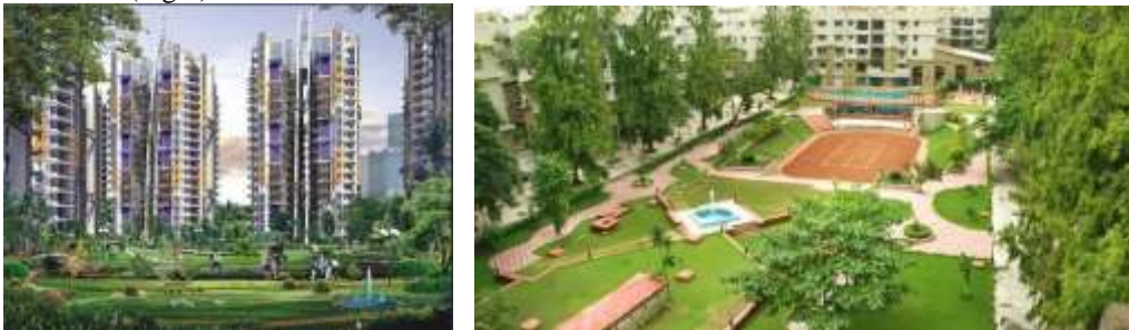
Fig. 3:- Creating and maintaining aesthetically appealing, functionally efficient and healthy environment

It is the time now, to encourage environmental designer and decision makers, to think carefully to satisfy the needs of local society for a more adequate neighborhoods planning and design, with open space for civic opportunities, sidewalks and streets based on the grid system, an integrated use of mixed-residential, retail, and office space within walking distance from residential units, Creating and maintaining aesthetically appealing, functionally efficient and healthy environment (Fig.3). 7