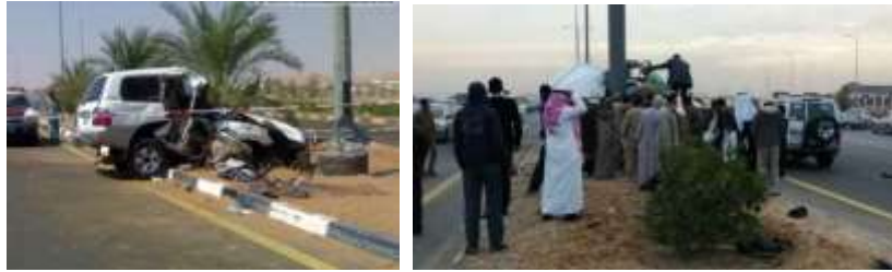
Fig. 2:- The inadequacy of planning and design of traffic streets, the lack of crash barriers and reckless driving caused a fatal traffic accidents, which resulted of 18000 annually rate death in Saudi Arabia.

Despite robust growth of the Saudi economy, developments in the transport sector have not been forthcoming. The poor state of public transport infrastructure is a fall-out of years of neglect. Easy accessibility to private automobiles and low fuel prices have steadily increased automobile traffic levels leading to rise in congestion and accidents in urban areas. Traffic accidents have become a serious problem facing the country. During the period from 1971 to 1994, the numbers of traffic accidents, injuries, and fatalities have increased by 30 times, 6 times, and 7 times, respectively 6 (Fig.2).