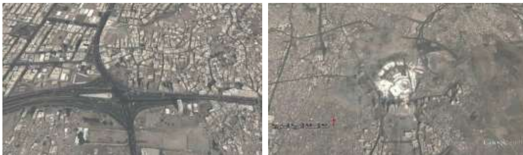
Fig. 1:- Unfortunately, the overall Aerial view of the Holy City of Makkah, reveal the scarcity of all kinds of urban outdoor open spaces. No heretical green net of recreational areas, no adequate urban plazas, no residential gardens,