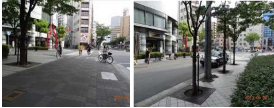
Fig. 17:- A Street has important public realm functions beyond the movement of traffic. These functions include place-making, providing access to buildings, parking, and the location of public utilities and public lighting. Osaka, Japan