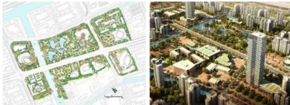
Fig. 13:- There could appropriately increase the amount of green space, which could create a pleasant green environment and effectively improve micro-climate as well, for example ,Qizhong Maqiao Large-scale residential landscape design that has diverse requirements,