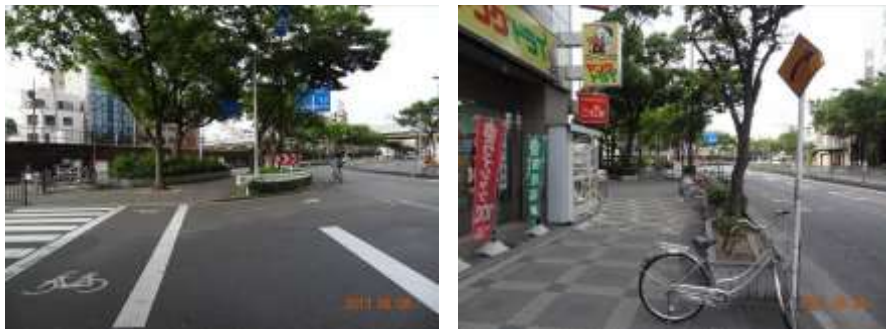
Fig. 18:- Most residential streets – as witnessed by many existing streets in cities and towns – can successfully combine low to medium traffic movements with a pleasant residential setting, including on-street parking where street widths permit.

Most residential streets – as witnessed by many existing streets in cities and towns – can successfully combine low to medium traffic movements with a pleasant residential setting, including on-street parking where street widths permit. The design should also allow for the delivery of goods and services (such as waste collection) to dwellings. Consideration should also be given to the needs of blind or presence of a footpath curb, visually impaired people who might normally rely on the pavements curb (Fig.18).