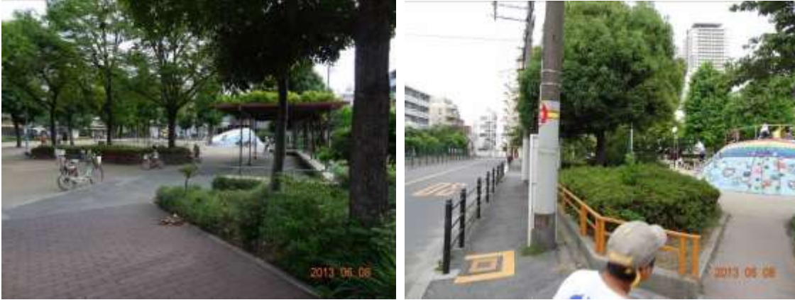
Fig. 8:- Residential landscape is not only providing residents a vision, but also, at the same time functioning well for residents.