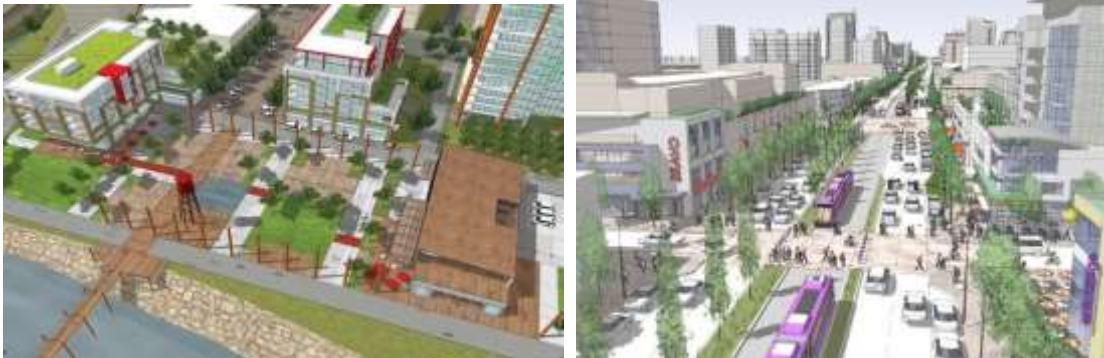
Fig. 5:- Regard should always be given to ways of integrating pleasant, attractive and landscaped areas of residential spaces and place, including children’s play spaces, as an essential element of any new residential development to meet the needs generated by that development.

attractiveness of a development, especially where the principles of defensible space to be regarded as an important programs to restructure the physical layout of communities to allow residents to control the areas around their homes. This includes the streets and grounds outside their buildings and the entrances and passageways within the residential environment development, to help people preserve those areas in which they can realize their commonly held values and lifestyles. Developers should therefore make adequate provision for open space in the form of gardens, parks, urban plazas, patios, balconies or terraces, depending on the characteristics of the development proposed and the surrounding context (Fig.5 &6).