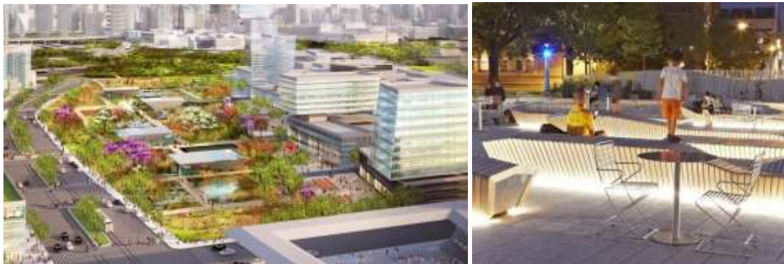
Fig. 15:- Public space is the main space in residential area, including roads, green spaces, and squares and so on. Therefore, whether there is a comfortable shared space will affect the quality of the environment in the residential areas.

Public space is the main space in residential area, including roads, green spaces, and squares and so on. Therefore, whether there is a comfortable shared space will affect the quality of the environment in the residential areas. Meanwhile, the comfort is also a basic requirement of the landscape design. In this context, it is preferable to establish a comfortable road system, because the roads seem like skeleton and the reasonable design of road system has directly effects on the residents traveling and security. Adding to that, the appropriate scale of space could enhance the using efficiency and improve the comfort as well (Fig.15).