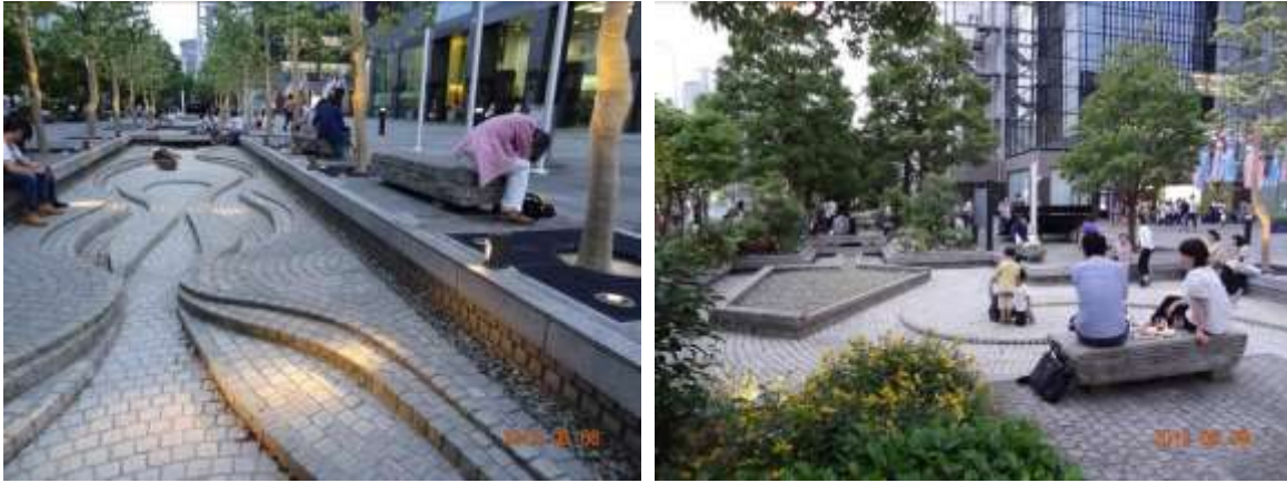
Fig. 10:- Spontaneous activity space is put forward from spontaneous activities and means generated activities when people want to participate, and when the time and place is possible. Such activities include walking, playing with dog and a breath of fresh air, morning exercises and watching interesting things and so on.