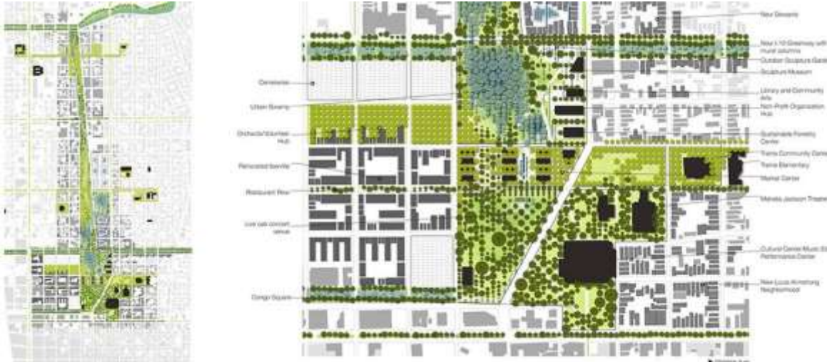
Fig. 14:- The outdoor environment of inhabitation is created by variety kinds of space, green, landscape pieces and service facilities. Residential landscape is the important space for people's daily life, that support a denser residential/commercial organization.