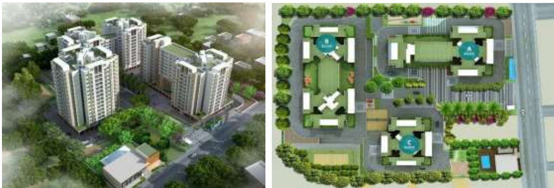
Fig. 16:- Green is not only the most extensive and frequently used part of living environment, but also the closest natural environment and having the greatest influence on residents in urban landscape.