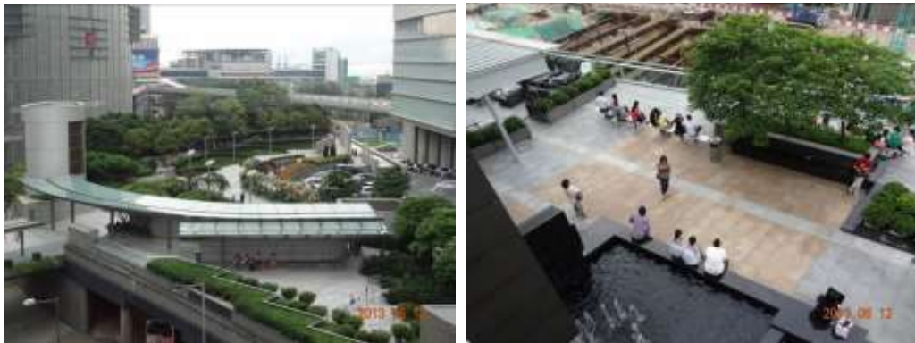
Fig. 11:- Societal activity refers to the various activities in public space where people would like to participate. It includes greeting, talking, children's games, small-scale leisure activities and so on.

Societal activity refers to the various activities in public space where people would like to participate. It includes greeting, talking, children's games, small-scale leisure activities and so on. Such activities could be generated in the various occasions and could be regard as an extension of spontaneous activities. The social activity space has a wide range and society activities could be happened in most of the public space. Of course, the quality of the space will still affect the activities. If the space has a comfortable and pleasant environment, people would like to hang around, relax, and stay in the same space. Also, it will naturally bring more various social activities and increase the communication for the residents and create active atmosphere in residential area (Fig. 11).