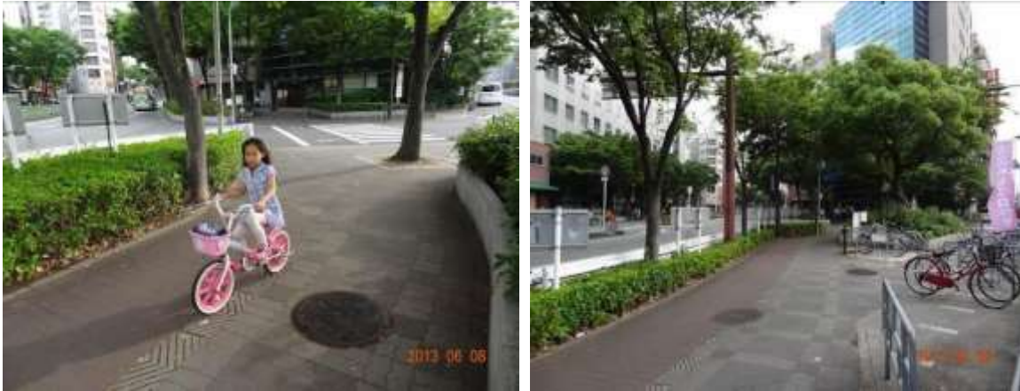
Fig. 7:- Developers should therefore make adequate provision for open space in the form of gardens, parks, urban plazas, patios, balconies or terraces, depending on the characteristics of the development proposed and the surrounding context.

indoor environment. It is a biological environment centered about human beings and composed of the natural environment, artificial environment and social environment (Fig. 7).