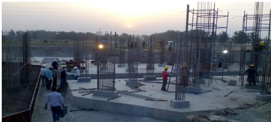
Figure:- Picture showing safety at construction sites.