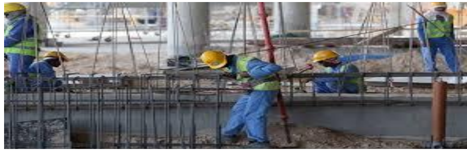
Figure:- Picture showing workers at construction site.