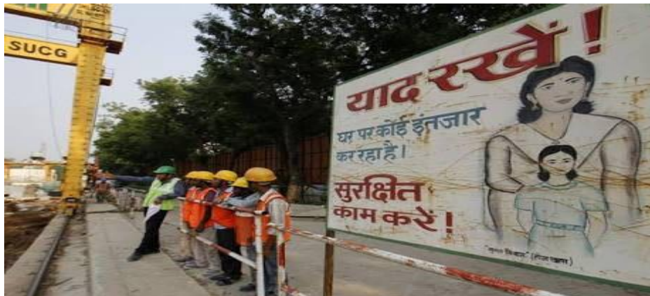
Figure:- Picture showing hoarding with cautious message.