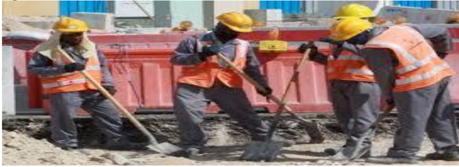
Figure:- Picture showing workers working with safety equipments, which are helmet and gloves.