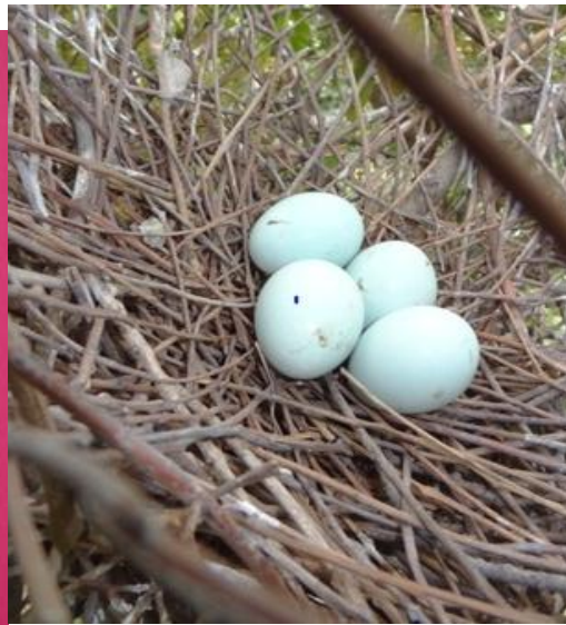
Fig. 3: A nest with four eggs