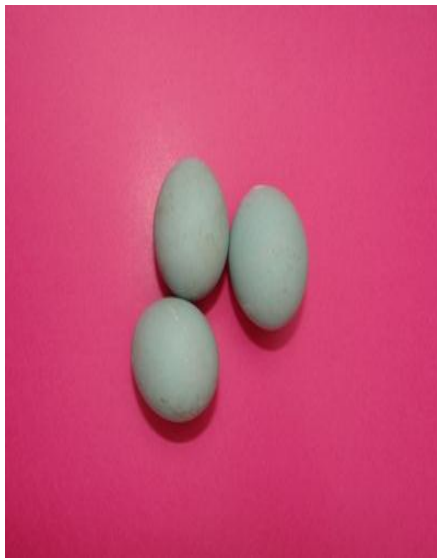
Fig. 2: Clutch size of three

**Statistical significance at level p<0.01.