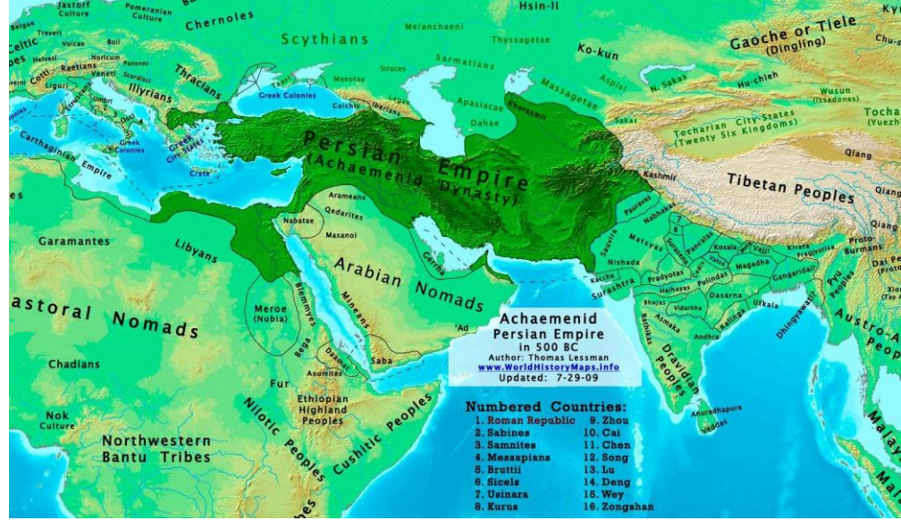
MAP OF PERSIAN EMPIRE AND CAPTURED INDIAN PLACES

At the end, we may conclude with the following observation of V.A.Smith, "the continuance of strongpersian influence upon India is Indiacted by vinces near the forontier, by the long continued use of the persain title of satraps, by the form of the asoka of the asoka inscription and by the architetecture. Some small particulerars which happen to be recorded are sufficient to snow that in the time of the first mauryan emperor, the court was affected by Iranian practices. The arthashastra rule that the king, when consulting physician and ascetics, should be seated in the room where the sacred fire has been kept, seems to be an indication that the Persian ritual was honoured at the maurayan court. We are told also that ceremonial washing of the king's hair was made the occasion of a splendid festival when the countries offered rich presents to the king. That observance recalls the presian hair-washing ceremony on the sovereign's birthday as described by Herodotus."