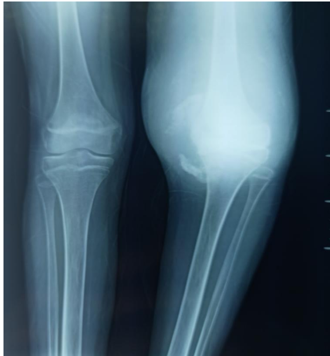
Figure 3: X ray of the knee

Knee X-ray shows swelling of the PM with calcifications, whereas Knee CT scan shows a collection of the quadricipital recess with polymorphous peripheral calcifications with posterior femorotibial dislocation with medial remodeling.