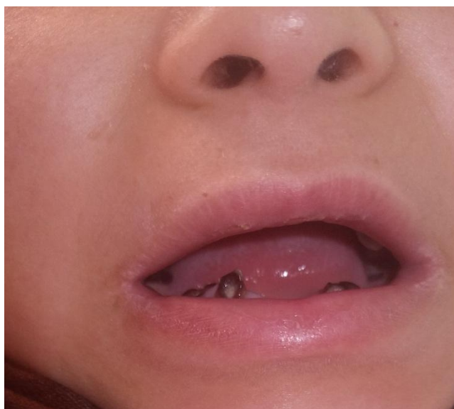
Figure 2: facial features shows amelogenesis imperfecta

Facial features shows an hypoplastic amelogenesis imperfecta, with no dysmorphic facial features including no hypertelorism and no short neck.