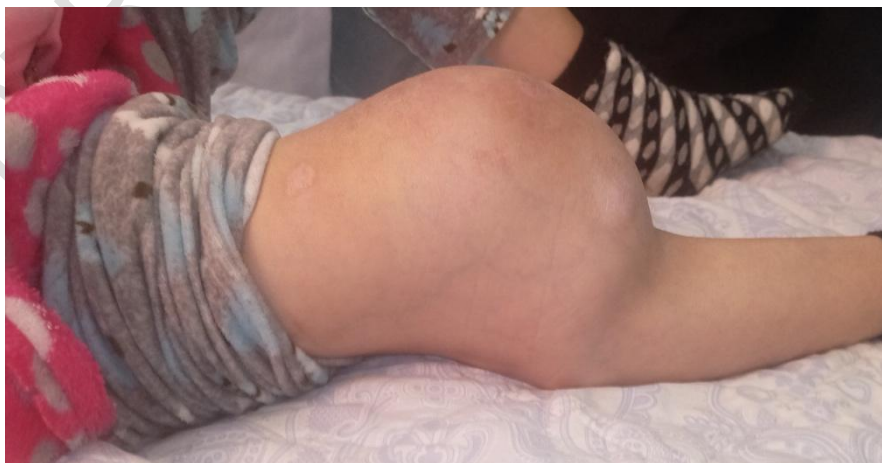
Figure 1: side view of the knee shows effusion

On clinical examination, we found a short statue of 135cm, partial functional impotency, knee swelling without any inflammatory signs, an internal and posterior-anterior laxity of the knee, patellar burying, a positive patellar shock; a painless gentle active and passive mobilization of the knee with a normal vascular-nervous examination.