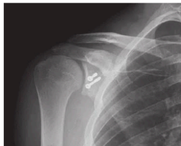
Post Operative X Ray