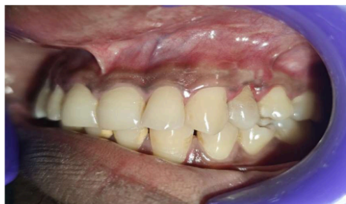
Figure 10:- 3 months follow-up