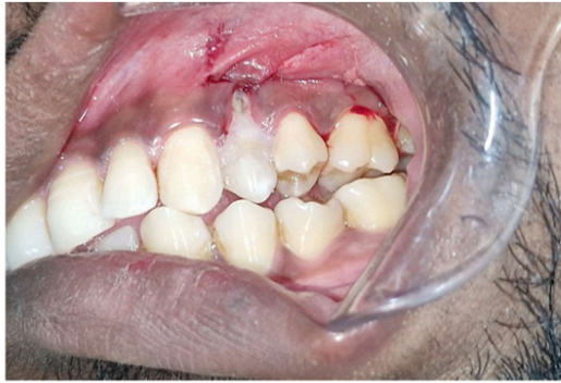
Figure 5: Incisions given