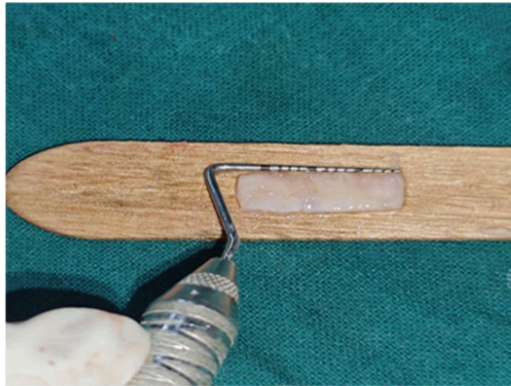
Figure 6:- FGG harvested from palate.

1 FGG was harvested from the canine to first molar area of the palate, de-epithelialized using a #15C blade extraorally, and trimmed to a thickness of approximately 2 mm. The size of the graft was adjusted to cover the involved teeth. After mechanical treatment of the exposed root surface with Mini-Five™ Gracey curette the CTG was positioned at the level of the CEJ and sutured with single stitches using 5-0 resorbable suture (Vicryl®) to the de-epithelialized papilla. The flap was then positioned at least 1 mm coronally to the CEJ and closed using the same 5-0 resorbable suture for single stitches on the lateral release incision and a coronal sling suture around the teeth. (Figure 8)