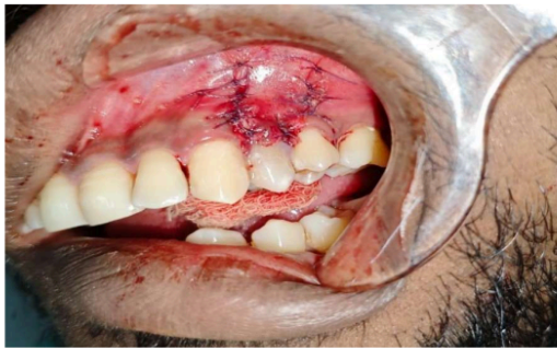
Figure 8:- Closure of CAF above the CEJ.