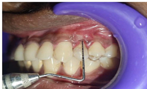
Figure 9:- 1 month follow-up