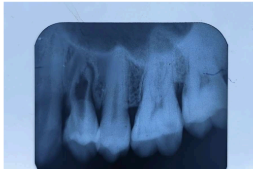
Figure 2:- Pre-operative IOPAR

The treatment plan was then finalized with: