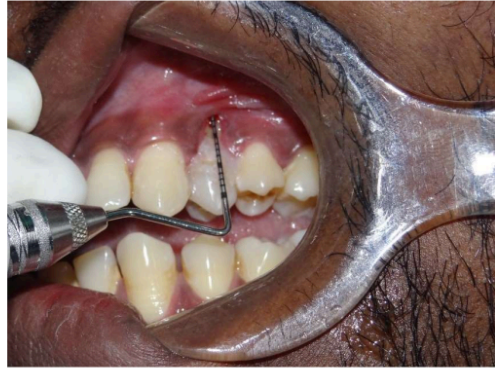
Figure 3:- Pre-operative recession.