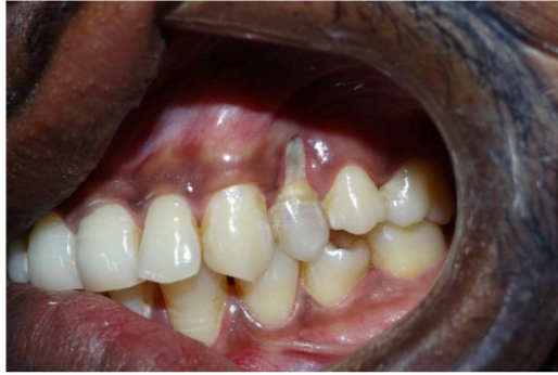
Figure 1:- Pre-operative view(I/O).