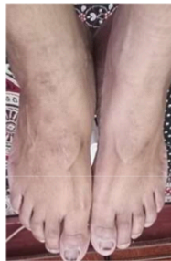
60 th day

Leeches were allowed to suck the blood for 30-45 minutes. The wounds caused by leeches were cleaned thoroughly with normal saline and dressing was done with betadine solution. An additional amount of blood (20-30ml) was lost due to slow and continuous oozing which lasted for some hours, if bleeding didn't stop by itself. No adverse effect reported.