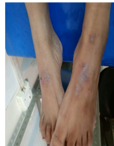
45 th day