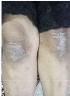
15 th day