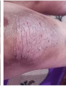
60 th day