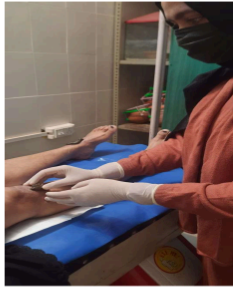
45 th day