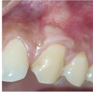
Figure 9: 8 month follow up

On 8 month follow up, 11 pocket depth was found of 2 mm and a CAL gain of 4 mm. 18 Complete root coverage was achieved. The keratinized tissue width increased from 2 mm to 3 mm. The patient showed good colour match, dense, healthy tissue and full root coverage. The patient was pleased with the recession coverage surgery's overall outcome and appearance.