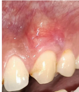
Figure 7: 1 month follow up