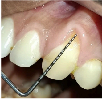
Figure 1: Pre Operative View

On intra oral examination it was seen as Miller's class I gingival recession of 3 mm on tooth #23. Clinical attachment loss (CAL) was 4 mm. Probing pocket depth (PPD) was found to be 1 mm. The gingival biotype was thin, with keratinized tissue width of 2 mm.