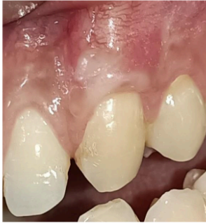
Figure 8: 4 month follow up