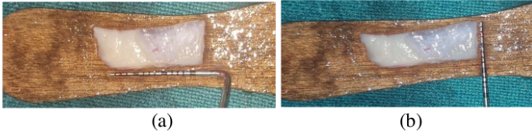
Figure 4: FGG harvested from palate and de-epithelialization done

A trapezoidal flap of varied thickness (split–full–split) a as prepared at the recipient site using a #15C blade under local anaesthesia. Both the horizontal incisions were 3 mm long made at a distance from anatomical papilla tip equals to recession depth plus 1 mm and two diverging vertical releasing incisions extended as far as the alveolar mucosa.