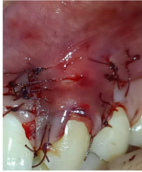
Figure 5: Immediate post surgical situation