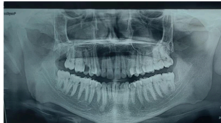
Figure 2(b) Pre operative OPG

Treatment plan: Root coverage utilizing a coronally advanced flap (CAF) alongside a connective tissue graft (CTG) harvested from the palate.