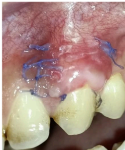
Figure 6: 14 days follow up

Patient was followed up after 14 days (figure 6), 1 month (figure 7), 4 months (figure 8) and 8 months (figure 9)