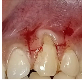
Figure 3: Primary incision