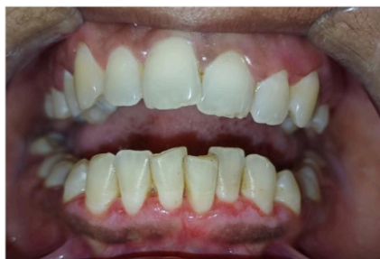
Figure 4: Follow up after 1 week