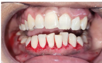
Figure 3: After removal excess tissue through gingivectomy