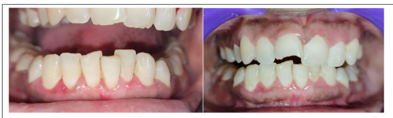
Figure 5: Follow up 3 months and 1 year respectively