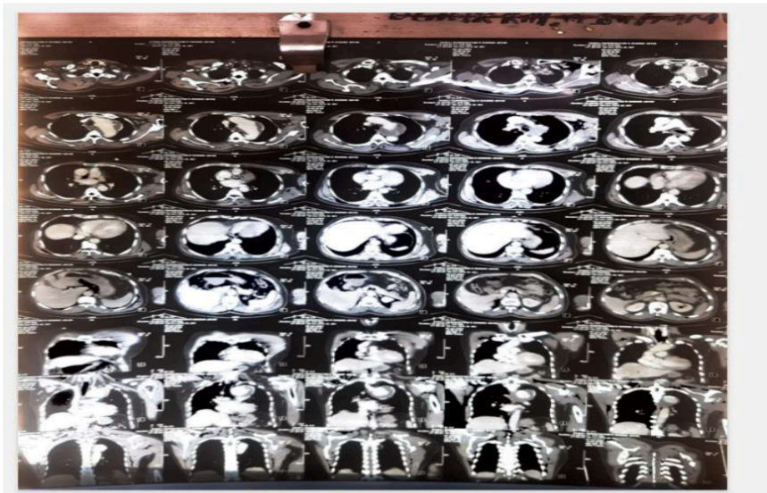
Figure 2: CT Scan Thorax showing fusiform dilatation of arch of aorta