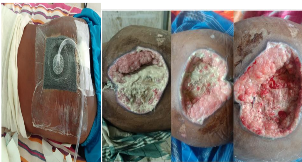
Fig: NPWT over the sacrum and Day 0, Day 5 and Day 11 after NPWT