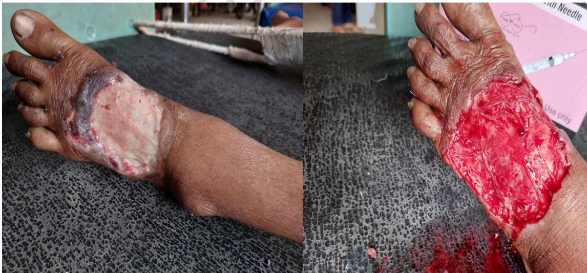
69 Fig : Granulation cover in NPWT versus NSD groups