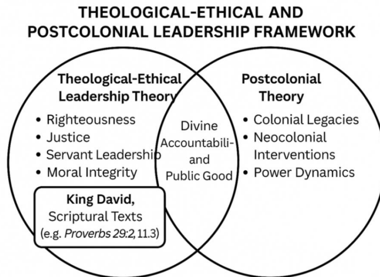
Figure 1: Theological-Ethical and Postcolonial Leadership Theoretical Framework

This study employs a hybrid theoretical framework that combines Theological Ethical Leadership Theory with Postcolonial Theory to analyze Africa's governance crisis. The Theological Ethical Leadership framework draws on scriptural values such as righteousness, justice, humility, and moral integrity, exemplified by biblical figures like King David. Citing Proverbs 29:2 and 11:3, it underscores the societal well-being that results from righteous rule and contrasts it with the destructive effects of corrupt governance. It frames leadership as a moral and spiritual calling that places divine accountability and selfless service above personal or political gain. Scholars highlight the role of biblical ethics in shaping leadership that reflects divine justice and integrity, fostering public trust and counteracting political corruption (Sanou, 2021; Dawson, 2024; Okoye, 2025). Integrity and transparency are not only ethical virtues but also essential strategies for effective leadership, as they build trust, strengthen institutional credibility, encourage ethical conduct, empower teams, and improve decision-making (Gaylord, 2024).