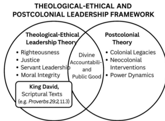
Figure 1: Theological-Ethical and Postcolonial Leadership Theoretical Framework

This study employs a hybrid theoretical framework that combines Theological Ethical Leadership Theory with Postcolonial Theory to analyze Africa's governance crisis. The Theological Ethical Leadership framework draws on scriptural values such as righteousness, justice, humility, and moral integrity, exemplified by biblical figures like King David. Citing Proverbs 29:2 and 11:3, it underscores the societal well-being that results from righteous rule and contrasts it with the destructive effects of corrupt governance. It frames leadership as a moral and spiritual calling that places divine accountability and selfless service above personal or political gain. Scholars highlight the role of biblical ethics in shaping leadership that reflects divine justice and integrity, fostering public trust and counteracting political corruption (Sanou, 2021; Dawson, 2024; Okoye, 2025). Integrity and transparency are not only ethical virtues but also essential strategies for effective leadership, as they build trust, strengthen institutional credibility, encourage ethical conduct, empower teams, and improve decision-making (Gaylord, 2024).