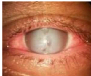
Figure 01 – Ocular Inspection.

A 32-year-old male patient with a history of bilateral keratoconus and rigid contact lens use, with irregular ophthalmologic follow-up, presented with acute pain and decreased visual acuity in the right eye for the past 15 days. He had been using 5% sodium chloride eye drops every 6 hours and a low-potency corticosteroid every 12 hours since symptom onset, without significant clinical improvement. On examination, diffuse corneal edema was observed in the right eye, with visual acuity limited to hand motion perception (Figure 1). Optical coherence tomography (OCT) revealed the presence of fluid structures with aqueous humor infiltrating the corneal stroma, resulting in corneal edema (Figure 2).