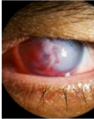
Figure 03 –Autologous blood injection.

In the absence of clinical improvement, an intrastromal injection of autologous blood was performed (Figure 3). During follow-up, persistent stromal edema was noted in the immediate postoperative period; after that, 7 days later, a significant reduction in edema and complete resolution of pain were observed. By day 15, the hydrops had fully resolved (Figure 4). After three months, the patient remained stable and was deemed suitable for a trial of rigid contact lens fitting (Figure 5).