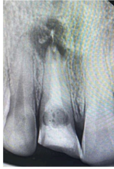
1(d) Ca(OH)2 dressing

One week later in the second visit, the tooth was asymptomatic, the Ca(OH) 2 (Dentocal; Anabond-Stedman) 1 was removed by using ultra sonic agitation of a 17% EDTA irrigation solution (DESMEAR; Anabond-Stedman). After the final irrigation, the root canal was dried with sterile paper cones. Obturation was done with filling the entire canal with MTA putty (BioStructure MTA Putty) material (Fig-2a). 6 MTA was then gently condensed to the working length using an endodontic plugger (GDC). The procedure was repeated several times until the root canal was completely filled with MTA (Fig-2b). 7 A wet cotton pellet was placed on the MTA and the cavity was sealed temporarily sealed. After 2 days the temporary restoration was removed and 5 the access cavity was restored with GIC restoration (GC Gold Label 2 Glass Ionomer cement) (Fig-2c). After one month, the tooth was completely asymptomatic, tooth preparation was done and PFM crown was given to the patient (Fig-2d). 3 No clinical and radiographic findings were found after the 1 year follow-up examination