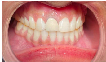
2(d) Final Crown Cementation