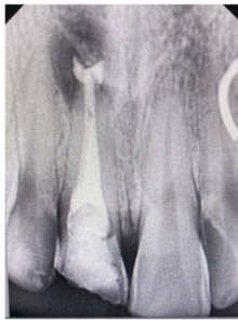
2(c) Radiograph showing complete obturation along with sealed perforation