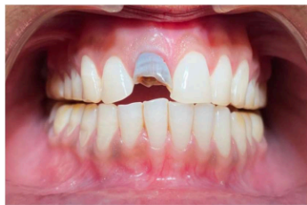
Fig-1(a) Pre-operative extraoral