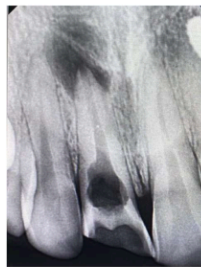
1(b) Pre-operative Radiograph