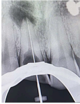
1(c) Working length determination