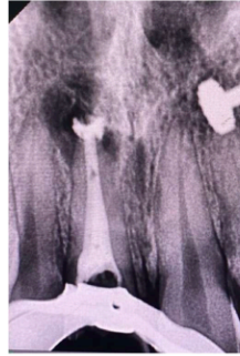
2(b) MTA filled till resorptive defect