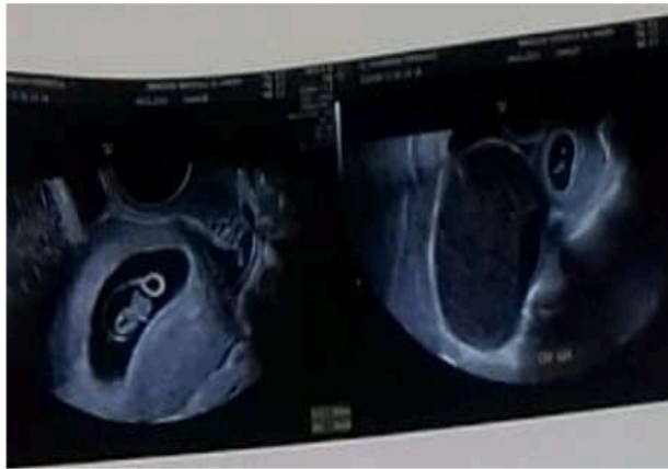
Figure(1):- Ultrasound imaging of a progressive intrauterine pregnancy associated with a large cystic formation in the left ovary.

Postoperatively, tocolysis was initiated using intravaginal progesterone (40 µg/day) for six weeks to prevent preterm labor. The patient's recovery was uneventful, and her pregnancy progressed without complications. She delivered a healthy male infant weighing 3,200 grams at 40 weeks of gestation.