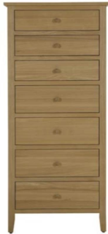
Figure 2 Stimuli (Tyagi, 2017)