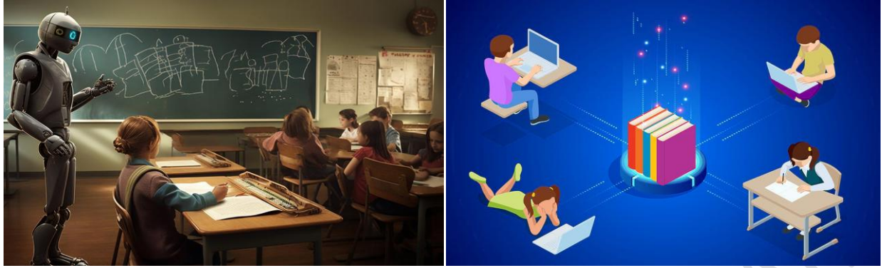
Figure 2: Role of AI in education system [57] and revolution of future education system [58]