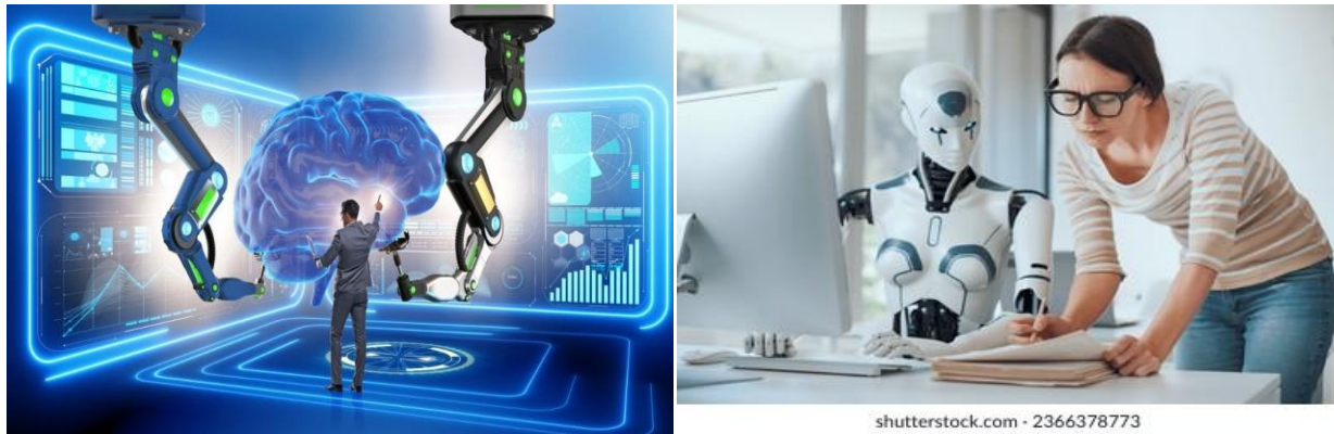
Figure 1: AI and the future of life and working relationship between human and robots [4, 55]

opportunities, particularly in areas like AI, robotics, biotechnology, smart shipping, smart transportation, smart healthcare, and data science, requiring a skilled workforce. The World Economic Forum declared that, 4IR technologies can play a vital role in addressing environmental challenges by promoting sustainable energy solutions, optimizing resource management, and reducing pollution [46]. A key aspect of 4IR is a human-centered approach, focusing on enhancing human well-being, preserving cultural heritage, and promoting social values [47].