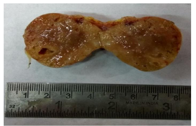
Fig 1:- Warthin Tumor of Parotid Gland.

Table 2:- Histopathological spectrum of salivary gland lesions.