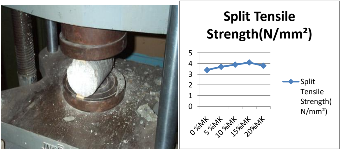
Fig.3:- Split Tensile testing.