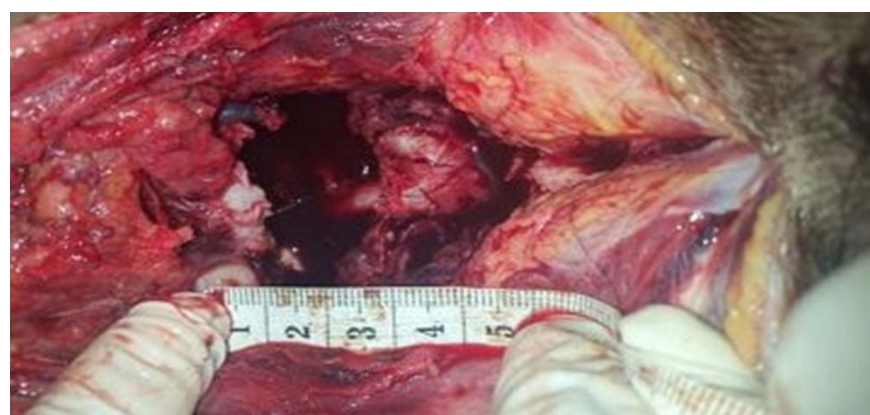
Figure 2(B):-Showing the distance between the C2 and C3 facets at post mortem which is approximately 3cm.