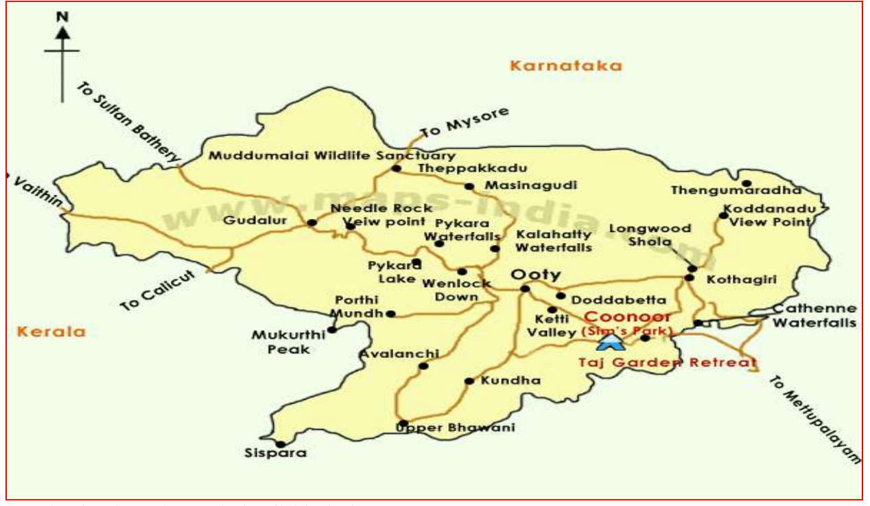
Map showing the study area the in Nilgiri District