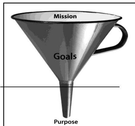
Figure 1.2. The Relationship Between Mission, Goals, and Objectives

Objectives , on the other hand, are short-term, specific performance targets that are attainable, measurable, and controllable. Every objective should reflect some general business goal and include a technique for measuring progress toward its accomplishment. To be meaningful, an objective must have a time frame for achievement. Both goals and objectives should relate to the company's basic mission (see Figure 1.2.).