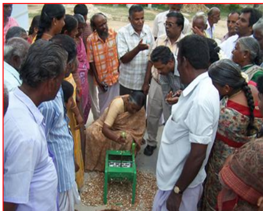
Fig.1 Field demonstration of sitting type groundnut decorticator

In the present system of groundnut stripping, the harvested groundnut vines are heaped in the fields and the farm women separate the pods from the vine by stripping with hands. Since the farm women were not aware or exposed to the equipment for stripping, the groundnut stripper (manual and power operated) were popularized among the farm women in the selected villages where groundnut is predominantly grown. The performance of the equipment at field condition was collected and is presented in table 2.