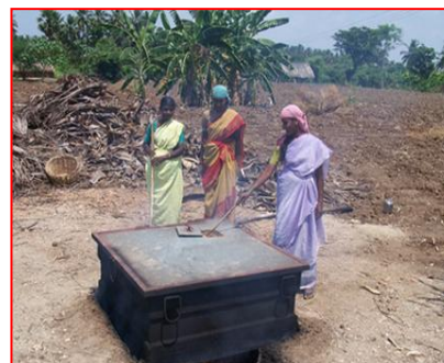
Fig. 2 Farm women operating the improved turmeric boiler

women were highly satisfied with the performance of the equipment and showed their willingness to adopt the same.