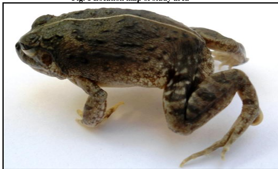
Fig. 2 Sphaerotheca breviceps (Study Specimen)