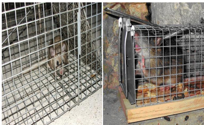
a) Rat trap

Polli, J. E., In Vitro Studies are Sometimes Better than Conventional Human Pharmacokinetic In Vivo Studies in Assessing Bioequivalence of Immediate-Release Solid Oral Dosage Forms. The AAPS J 10(2): 289-99, 2008.