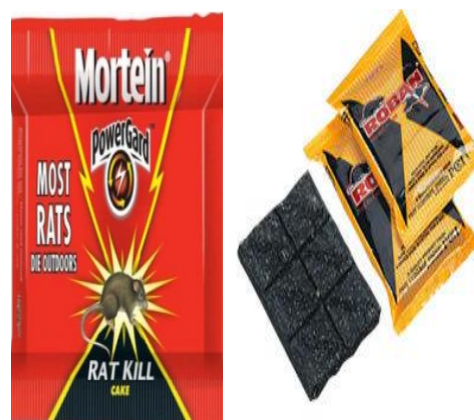
b) Rat poisons