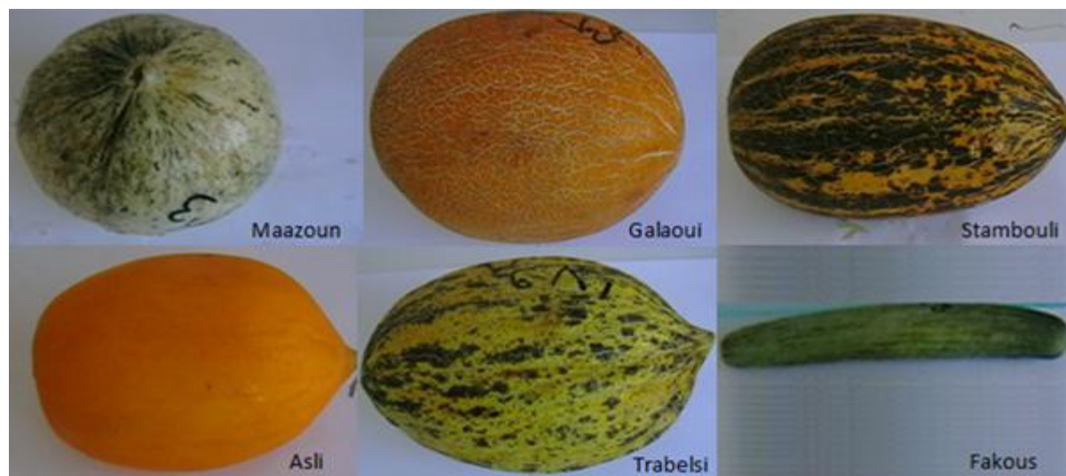
Fig 1. Tunisian varieties of melon ( Cucumis melo L.) and fakous ( Cucumis melo var. flexuosus )