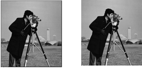
Fig 3. (a) Implementation of Bicubic Convolution Interpolation, and (b) Output of Bicubic Convolution Interpolation.