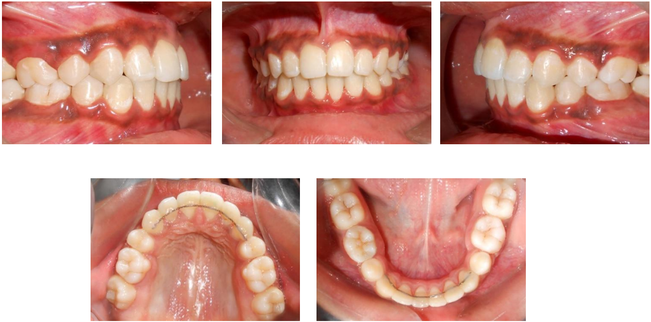
Fig 5: Posttreatment intraoral photographs

the patient with the optimal treatment options with the most stable and favorable outcome. Treatment options for the management of impacted teeth are separated into four categories: observation, intervention, relocation and extraction 19-21 .