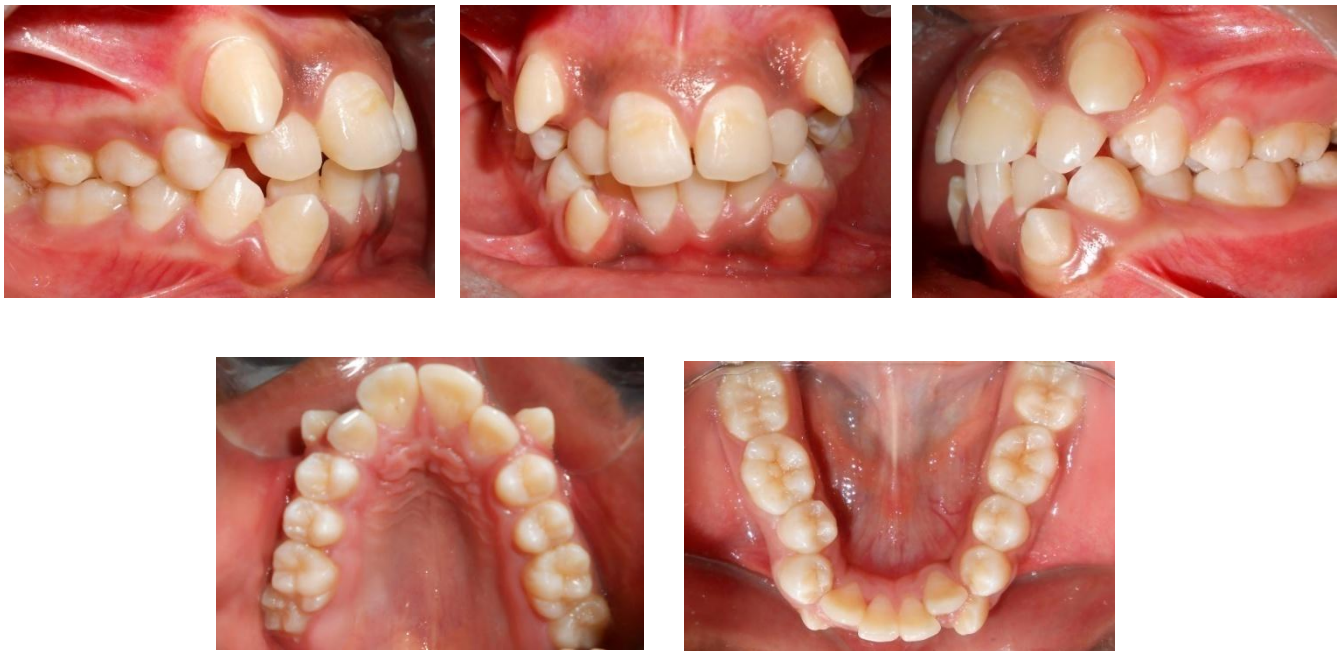
Fig 2: Pretreatment intra oral photographs