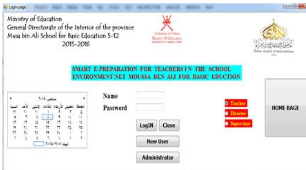
Figure 1.3. The user registration

The user registration can be done with help of username and password as shown in Figure 1.3.