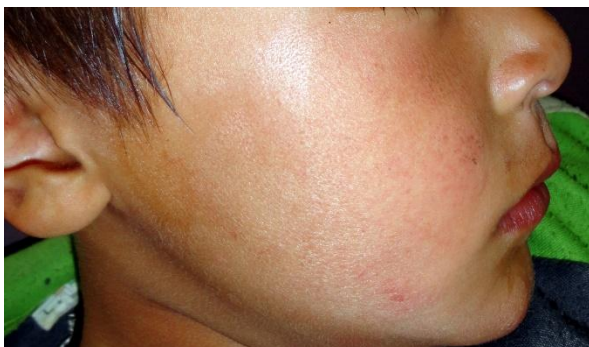
Figure 4. 6 months follow up recall