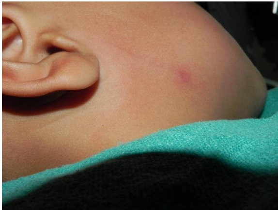
Figure 1 Pre-Operative