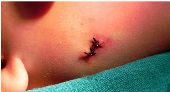
Figure 3 Immediate Post-Operative