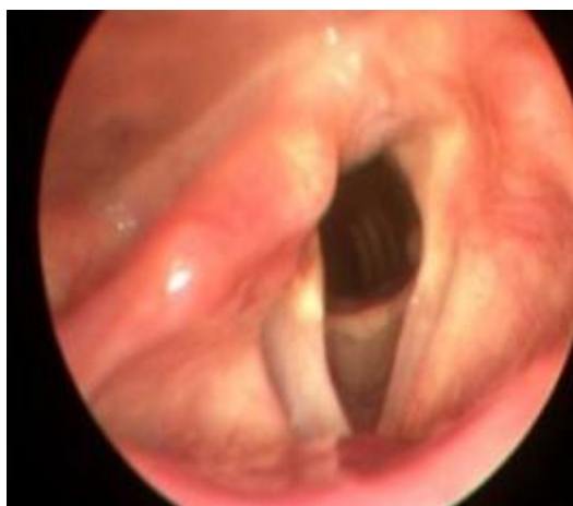
Vocal cord palsy