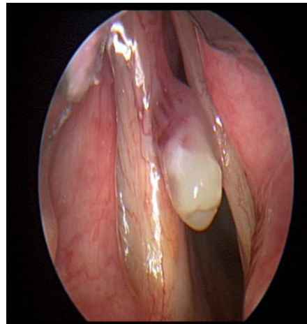
Vocal cord Polyp