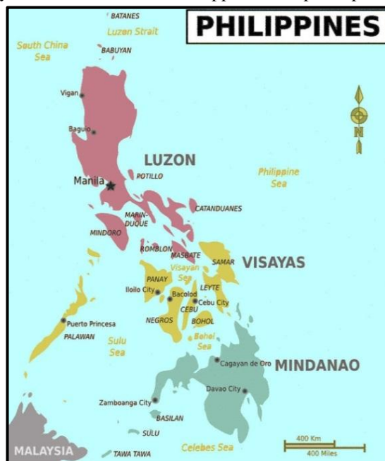
Figure 2. Map of the Philippines

Setting of the Study. The study was conducted in the Philippines with participants coming from Western Visayas.