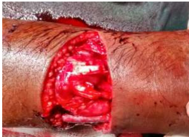
Fig. 1:- Radial and Ulnar artery repair interposition reversed saphenous vein graft.

Primary end to end anastomosis done in 4 patients when the defect was less than 2 centimeters (4/32=13%) In injuries with defect more than 2 cm defect Reversed Saphenous Vein was used as conduit. Synthetic grafts were not used to prevent infection 2 . Anatomical bypass was done in 25 patients (25/32=78%), and extra anatomical bypass in 3 patients in severely crushed limbs with contamination (3/32=9%) 3 .