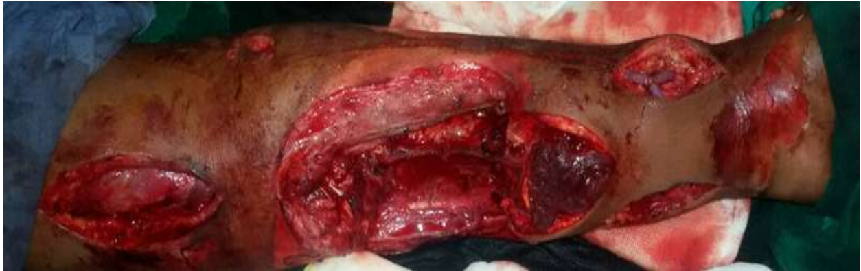
Fig.5 Extra anatomical bypass figure 4 and figure 5.

We did fasciotomies in most of patients, for those who had no flow status and those who presented after 6 hours. We did skin cover by relaxing incisions and Split Skin Graft primarily or secondarily in 8 patients (8/32=25%).