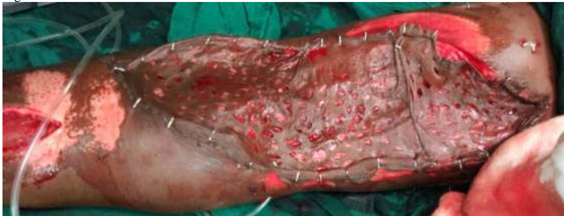
Fig. 7 Skin cover figure 6 and figure 7.